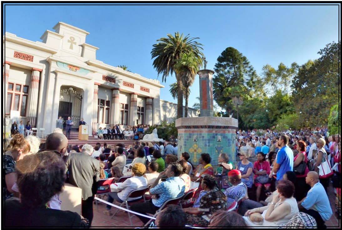
More than 2,200 members participated in the 2015 AMORC World Convention.